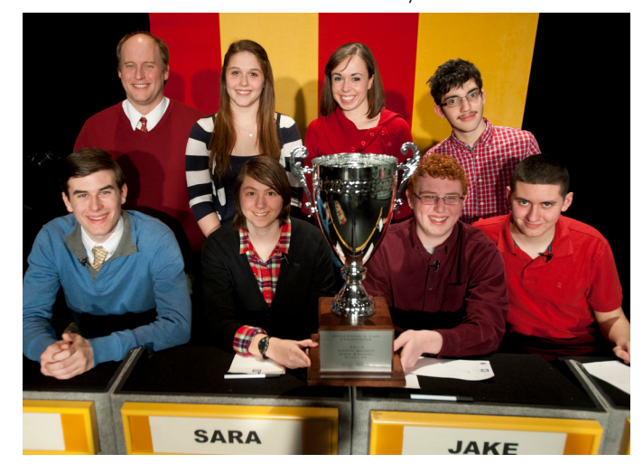
The Pinkerton Academy team from Derry won the 2014 Granite State SuperChallenge, as well as the NH-MA Governor's Cup match.

Counting on Birds, the fourth in a series of grant-funded Windows to the Wild bird documentaries, premiered in November 2013. The film explores the National Audubon Society's Christmas Bird Count